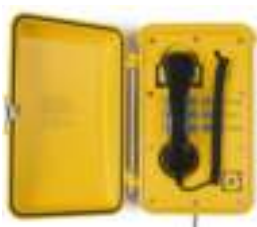
1008072200 – Door, Full Keypad 1008072220 – Door, No Keys