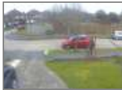
Powerful advanced parameters allow site-specific false alarms to be minimized