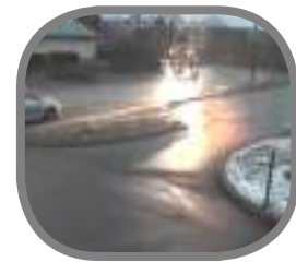
Car Headlight Alarm Reduction