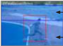
Detect objects with 'conflicting' criteria in the same scene