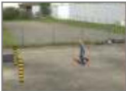
Standard default parameters for easy setup covering the majority of scenes