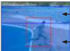
Detect objects with 'conflicting' criteria in the same scene