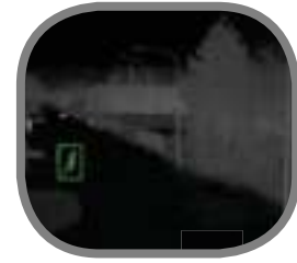
Thermal Camera Support