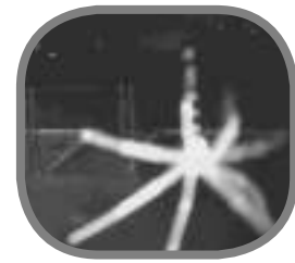
Spider/Insect Alarm Reduction