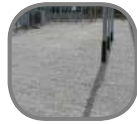
Sterile Zone Application