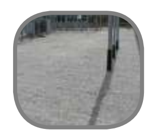
Sterile Zone Application